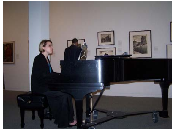
The reception at the Fred Jones Jr. Museum of Art