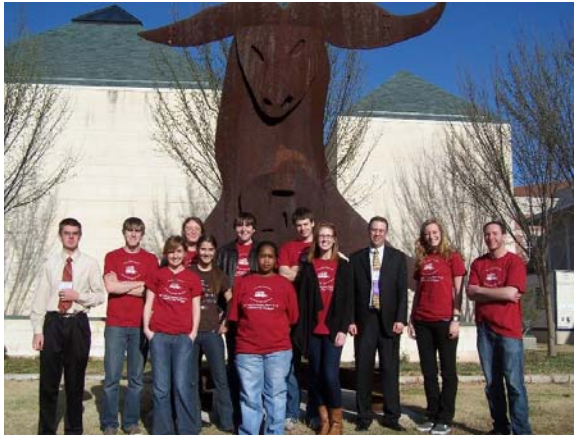
The helpful University of Oklahoma students who made sure we found our way around campus and who were easily identifiable by their cute red shirts!